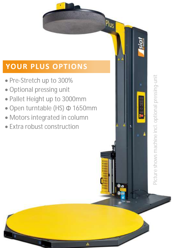
Picture shows machine incl. optional pressing-unit